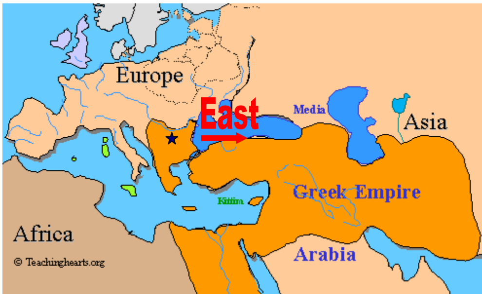
Figure 2: Expansion of the Grecian Empire

We learn that the goat comes from the West. In Figure 2 below, we can see the progression of the Grecian Empire from the West to the East. Alexander the Great is noted as a famous military general because of the speed in which he conquered his empire. He began by defeating the Medo-Persians in 334 at 21 years of age and expanded his territory to include the entirety of the Medo-Persian Empire, Greece, and additional parts of Saudi Arabia. He died at the ripe old age of 33 after reportedly grieving that there were no more worlds to conquer.