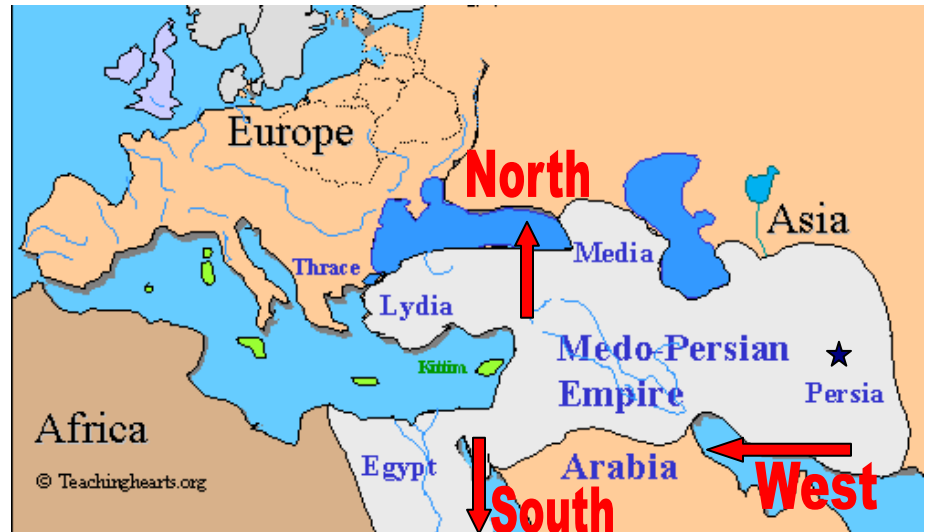
Figure 1: Expansion of the Medo-Persian Empire

Daniel 7:5 – “And behold another beast, a second, like to a bear, and it raised up itself on one side, and it had three ribs in the mouth of it between the teeth of it: and they said thus unto it, Arise, devour much flesh.”