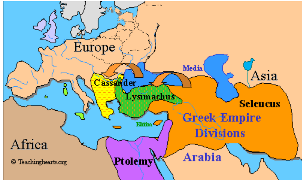
Figure 3: Division of the Greek Empire

Phrygia in 301 BC. Alexander's empire was divided at first into four major portions: Cassander ruled in Macedon, Lysimachus in Thrace, Seleucus in Mesopotamia and Iran, and Ptolemy in the Levant and Egypt. 3 Thus, we see the prophecy of God fulfilled.