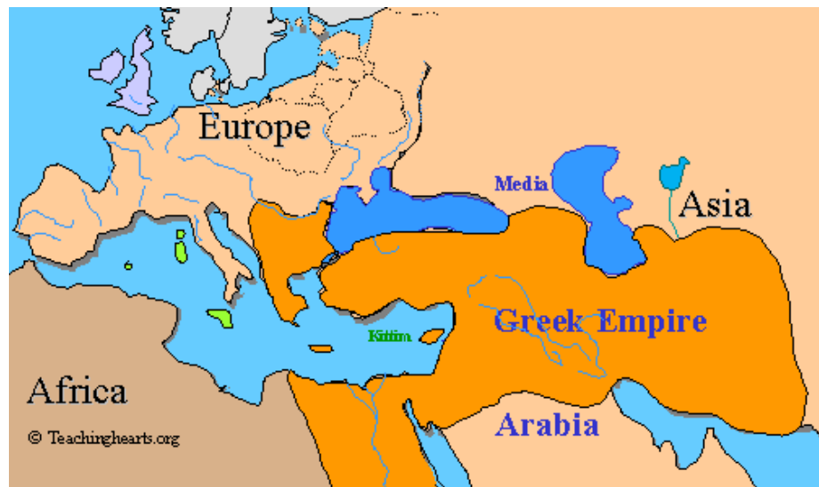
Figure 3: Greek Empire

Like the previous two empires, brass is a fitting symbol for the Greek Empire. Alexander the Great was the military leader of this empire as it expanded its borders. His army was arguably the most successful military power in human history. In his Antiquities, Josephus calls Alexander, “a king from the west, clad in bronze”. Elsewhere, Josephus refers to the Greek armies as ‘men of bronze’, coming from the sea. The bronze used to represent Greece in Nebuchadnezzar’s statue was prophetic of the armor that would identify Alexander’s armies. One might note that in the Greek Empire, for the first time, there were both an eastern and a western part of the kingdom. The western portion was that