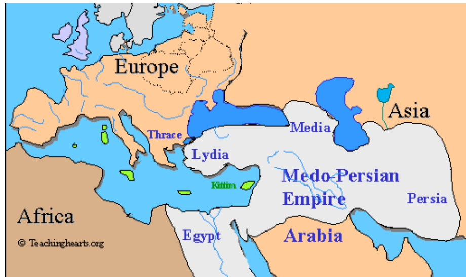
Figure 2: Medo-Persian Empire

Silver was appropriate to use as a representation of the Medo-Persian empire. Their currency, the daric (named after King Darius I), was silver and the Medo-Persian empire was renowned for their amazing wealth. In fact, we read in Daniel 11:2 that the sheer wealth of the Medo-Persians stirred up the Grecians to wage war against and conquer the Medo-Persian empire. The Medo-Persian empire was made up of an alliance between the Medes and the Persians. The Persians eventually became dominant in this alliance, which is symbolized in Daniel 7 by the bear raised up on one side.