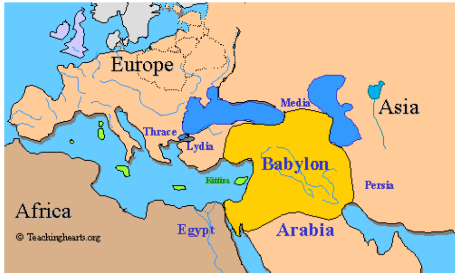
Figure 1: Babylonian Empire

As we continue to look at the other parts of the statue, we will begin to compare them with each other to understand the reason for the different types of metal used in the vision of the statue. Note the expanse of the Babylonian empire in the map above. What type of government did Babylonia have?